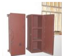
Lockbox at Terre Noire Guesthouse

Airlines are strict about carry-on items; you are allowed one carry-on bag and one other personal item such as a pocket book or backpack. Other items, such as a money belt, are considered a third item and will have to be stored in your carry-on bag. Liquids and gels must be no larger than 100 ccs (3 oz) and contained in a quart sized Ziploc bag (team leaders may allow space in the team's checked luggage for personal items that do not meet this criteria) Remember to remove all unessential items from your wallet; we recommend carrying only one credit card, driver's license and professional license. While traveling, keep ALL your documents and money on your person, NOT in your carry-on or checked luggage.