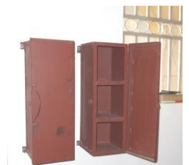
Lockbox at Terre Noire Guesthouse

Airlines are strict about carry-on items; you are allowed one carry-on bag and one other personal item such as a pocket book or backpack. Other items, such as a money belt, are considered a third item and will have to be stored in your carry-on bag. Liquids and gels must be no larger than 100 ccs (3 oz) and contained in a quart sized Ziploc bag (team leaders may allow space in the team's checked luggage for personal items that do not meet this criteria) Remember to remove all unessential items from your wallet; we recommend carrying only one credit card, driver's license and professional license. While traveling, keep ALL your documents and money on your person, NOT in your carry-on or checked luggage.