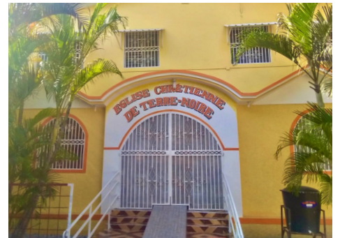
Terre Noire sanctuary.