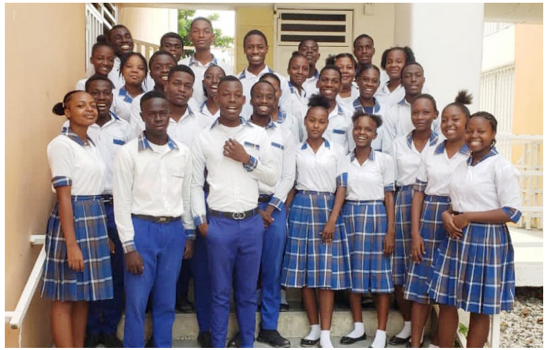
First 13th grade class!

This is the first time we are having a 13th grade class to take the Haitian national exams. The exams took place from July 1 to July 6. The students are all confident that they will be successful.