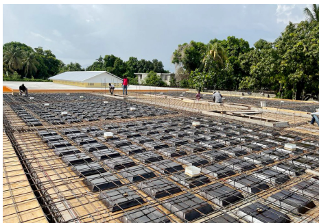
Progress on 4th classroom-foundation to roof.