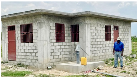
Caretaker's house and generator/clean water room.