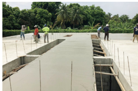
Roof on building 4 at Baryè Fè complete.

roof allowing for better ventilation, improved noise reduction, longer life expectancy and campus aesthetics. This project will have a short time for construction given the building has to be ready for September classes. To date, approximately $250K has been spent on the building pad, the building and approach road.