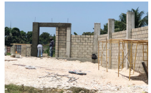
Completed security wall and gate for Espwa Campus.