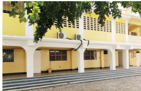
Exterior painting completed at the Terre Noire school.