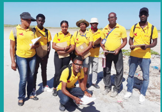
Curamericas Partnership community newly hired health promoter and care group leaders.

Repatriote in hopes of developing a partnership to help improve access to health care in the Repatriote community.