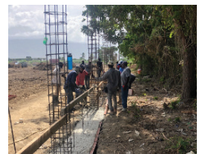
Espwa Campus construction.