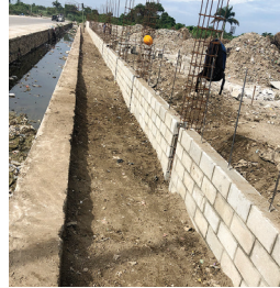
Espwa Campus construction.

We are very excited to announce that we have broken ground at that location and have begun building the infrastructure to accommodate many new initiatives. This initial construction includes a security wall around the entire property and an entrance road and gate. The first building will be a Bible College that is scheduled to open in October of 2021. This has been a dream of Leon's since