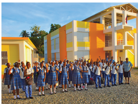
Above: 7th graders in front of Baryè Fè Building. Top right: Rendering of new Baryè Fè classrooms. Bottom right: Rendering of new classrooms and bball court.