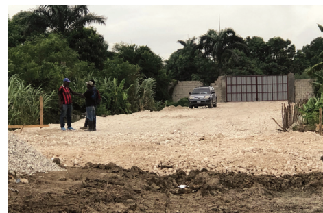
Espwa Campus, new entry road, new gate in background.