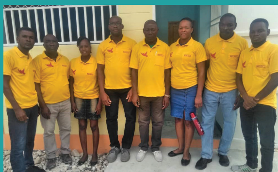
Cureamericas Partnership community health workers.

Haiti's maternal and child health statistics are the poorest in the Western Hemisphere. Maternal mortality rates (MMR) are estimated to be over 520 per 100,000 live births, considerably higher than the average MMR for all countries of similar development. The under-5 mortality rate in Haiti, estimated to be 89 per 1,000 live births, is among the highest in the world.