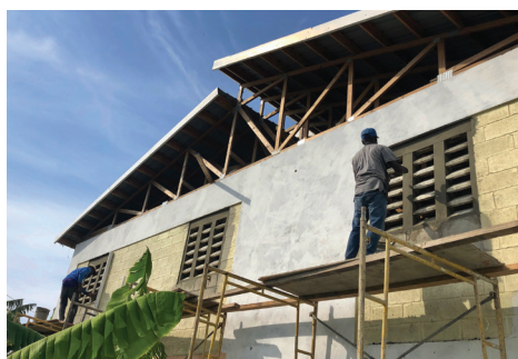
New windows at CS Children's church.