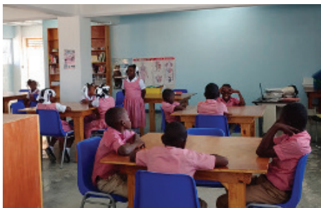
Repatriote library classes in new expanded library space.