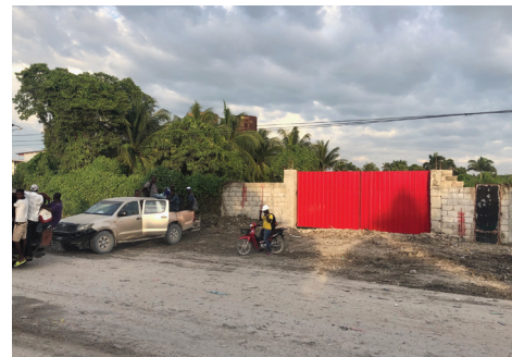
Espwa campus, new Entry way gate from Rue 9.