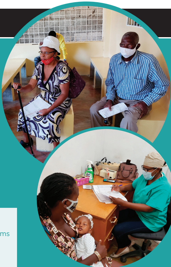
Top to bottom: The waiting area at the Terre Noire clinic. Patient visit at the Terre Noire clinic.