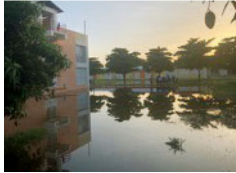
The above view is an unintended lake at Baryé Fé, after heavy rains.