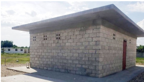
Completed bathroom building.