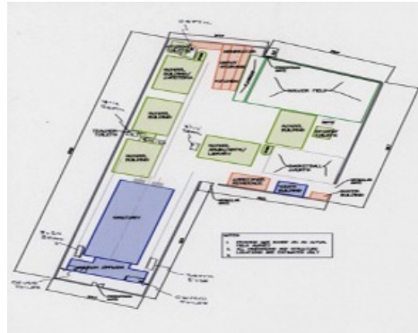
Design for Repatriote solar system.