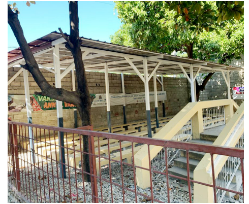
New roof installed for clinic waiting area.