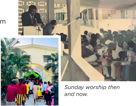
Sunday worship then and now.