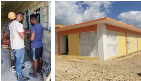
Electrical work being performed and completed classroom buildings.